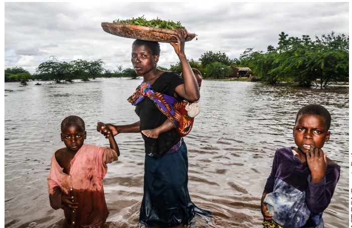
A mother helps her children away from home to a nearby camp at Nchalo.