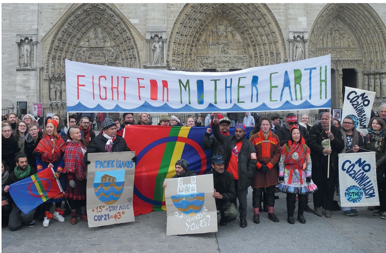
Together with partner organisations such as the Pacific Conference of Churches and other representatives from the Global South, ACT Alliance and Bread for the World call for “no-one to be left behind”.

has an important role to play regarding the transfer of knowledge, technology and financial resources – and civil society actors must be involved substantially.