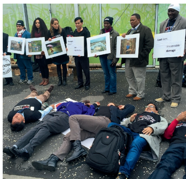
ACT Alliance publicises the emergency faced by the victims of climate change.

The fact that human rights are part of the agreement constitutes an essential step towards a human rights-based climate policy. The explicit obligation of states to protect and guarantee the right to life, appropriate shelter, food, water and health for their entire population, and the most vulnerable in particular, is strongly anchored in the agreement, and we need to take advantage of the opportunities that this provides.