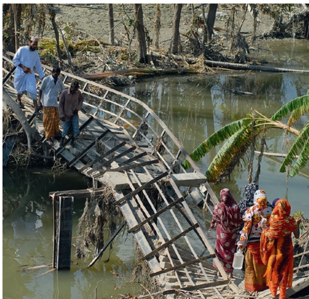
Fleeing from the elements - climate change is forcing the poorest people in many parts of the world to leave their homes.

Nevertheless, a task force is to be established focusing on approaches aimed at preventing climate-related displacement. This is very much in line with the demands made by many of the affected countries and non-governmental organisations for a displacement facility. However, the recommendations that the task force will develop whether such a “facility” really will be established in the long-term, and the services it would provide, will only become clear during future debates.