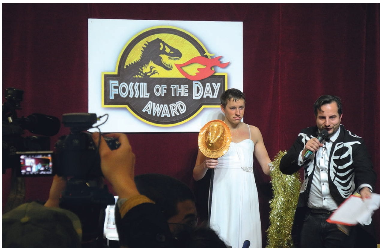
Each evening during the conference, the Climate Action Network handed out the “Fossil of the Day” award for the day’s worst climate policy performer.

If the required levels of negative emissions are to be limited as far as possible, and if the risks that they pose - people being forced off their land, increased human rights violations and threats to food security - are to be avoided, we will need to ensure that the ambition mechanism of the Paris agreement develops its full potential as soon as possible. Moreover, emissions from fossil fuel combustion, especially in industrial and emerging economies, will have to be radically reduced. Realistically, however, it will be impossible to avoid negative emissions if the targets set out in the agreement are to be met. Nevertheless, this doesn't mean that high-risk technologies such as CCS will be needed: an ecological transition in agriculture would also enable the land and the forests to regenerate and once again effectively help protect the climate in the long term.