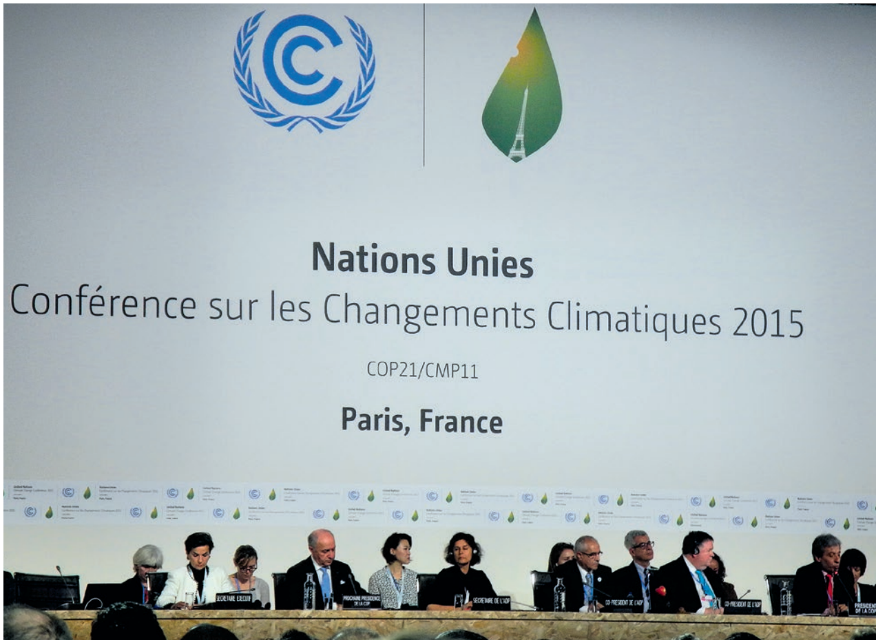
Laurent Fabius, the President of COP21, and Christiana Figueres, Executive Secretary of the UNFCCC, open the COP21 climate conference in Paris. The internationally binding agreement was signed by 195 parties.

These three goals clearly demonstrate that the Paris Agreement is different from its predecessor - the Kyoto Protocol - as it no longer merely focuses on mitigation and climate protection. In fact, the Paris Agreement is an attempt to leave behind the sectorial niches of the past and to pave the way towards a socio-ecological transformation and a climate-friendly world.