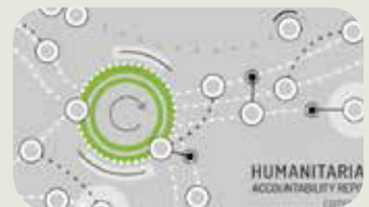
The CHS Alliance Humanitarian Accountability Report 2018