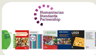
Sphere & Humanitarian Standards Partners are now 7!