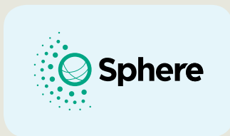
New Sphere Handbook 2018 with the Core Humanitarian Standard (CHS)