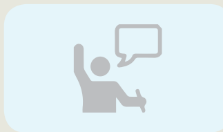
How are you training/ capacity building/ learning on Q&AAP?