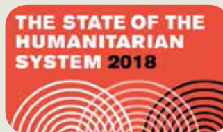
ALNAP 2018 State of the Humanitarian System (SOHS)