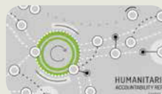
The CHS Alliance Humanitarian Accountability Report 2018