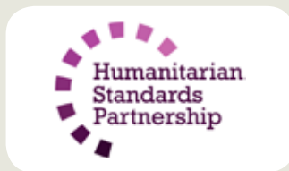
Sphere & Humanitarian Standards Partners are now 7!