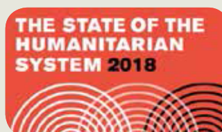
ALNAP 2018 State of the Humanitarian System (SOHS)