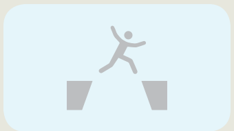
What opportunities and challenges are you facing?