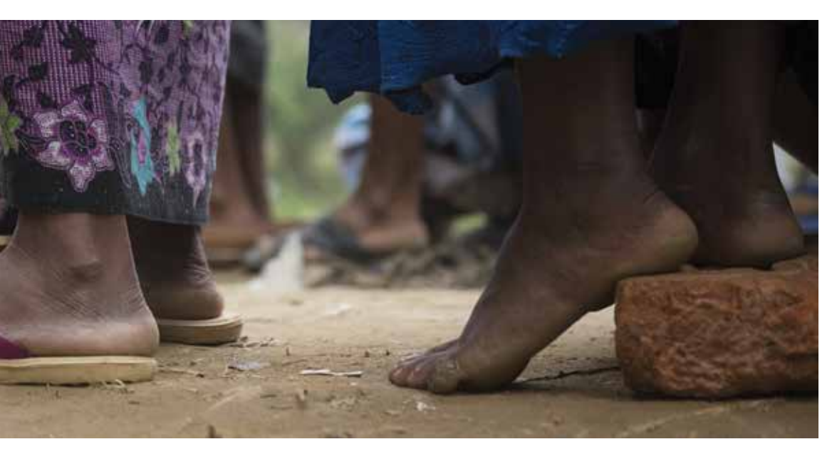
▲ Rohingya refugees wait in line for a humanitarian aid distribution at the Chakmarkul refugee camp in Bangladesh.